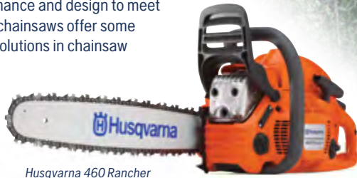
Husqvarna 460 Rancher

With the power, performance and design to meet your expectations, our chainsaws offer some of the most advanced solutions in chainsaw development, making them the perfect tool.